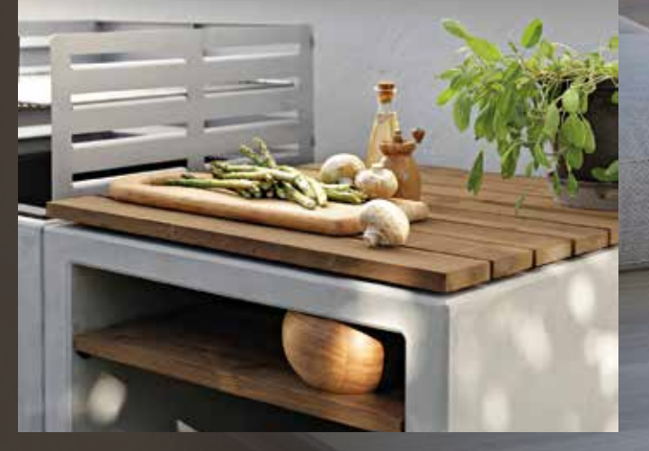
*Exclusions apply. See website for more warranty details.