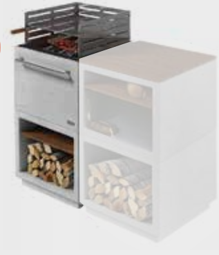
Air - BBQ Grill (965-010) Vertically configured with 2 x Extension modules (965-032), optional wooden top (965-140) and 2 x optional wooden shelves (965-199)

Air - BBQ Grill (965-010) Vertically configured with 2 x Extension modules (965-032), 2 x optional wooden tops (965-140) and 2 x optional wooden shelves for log store (965-199)