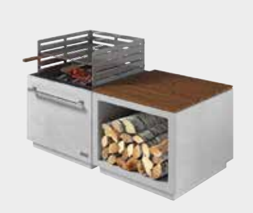
Air - BBQ Grill (965-010) Horizontally configured with optional wooden top (965-140)