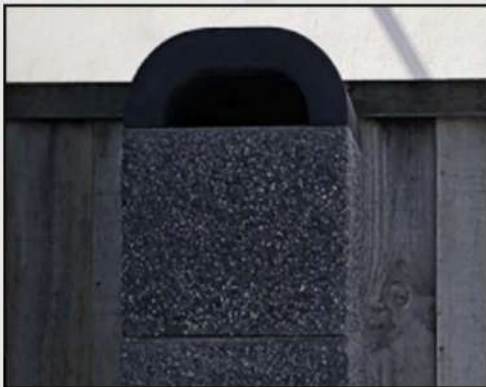
13. Install chimney cap