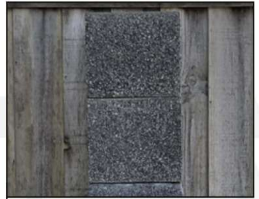
12. Install the remaining chimney sections