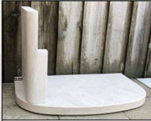
2. Install the first leg 50mm from the verge of the base