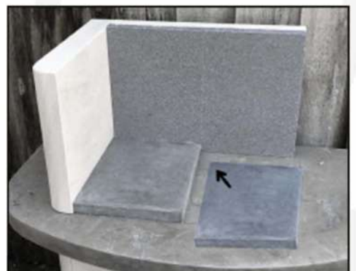
9. Install BBQ granite bottom tiles