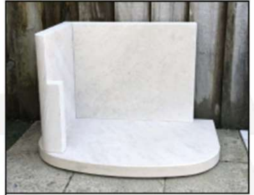
3. Install the 580x500mm back piece