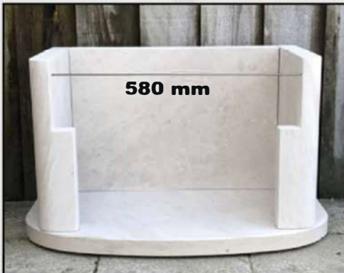
4. Install the second leg allowing a 580mm gap