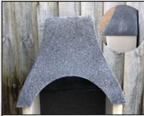
11. Install the gather making sure you leave a 10mm overhang