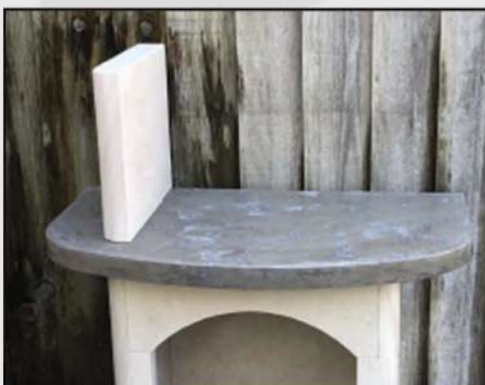
7. Install BBQ side wall