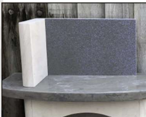
8. Install BBQ granite back