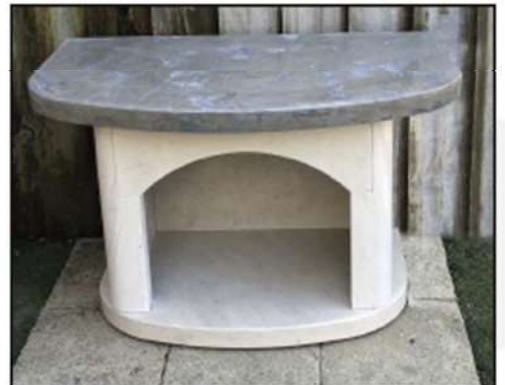
6. Install top shelf