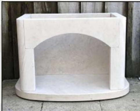
5. Install the arch