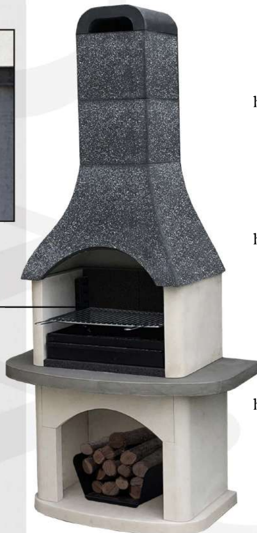
14. Install the steel BBQ insert