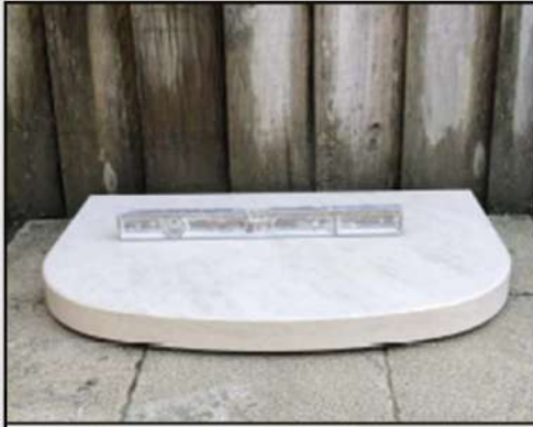
1. Level the base